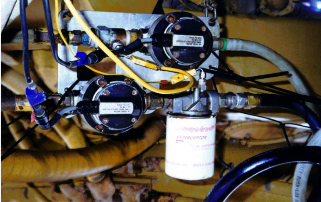
Photograph No. 1